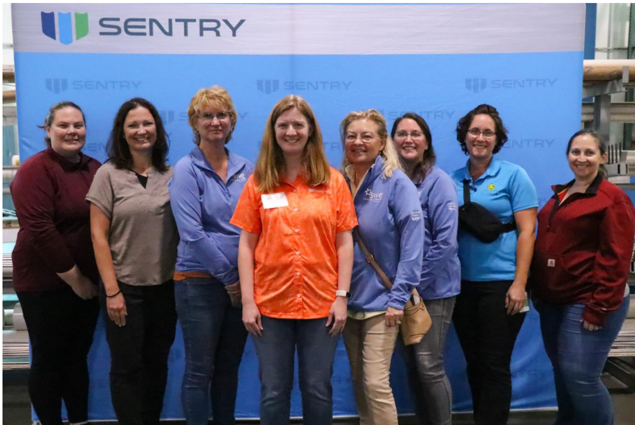
Photo from 2024 SWE-WI Sentry Tour. Join in on the factory fun this year!