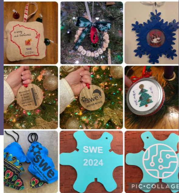
2024 SWE-WI Ornament Exchange