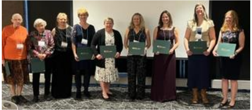
SWE-WI Members with 25+ Years SWE Membership